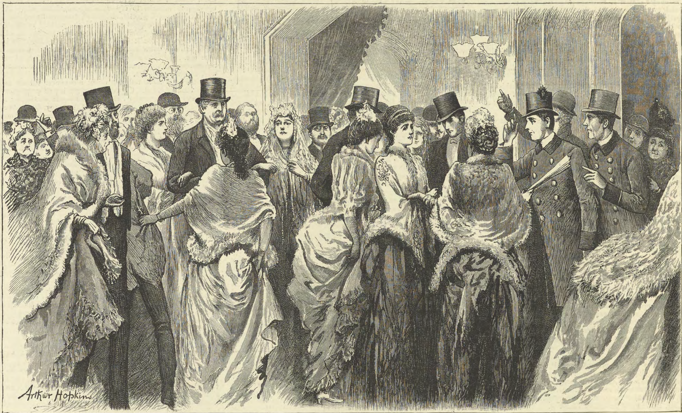
"IN THE RUSH AFTER THE PLAY WAS OVER I ESCAPED QUIETLY WITH PAPA"

After that I had a head-ache, and in the rush after the play was over, I escaped quietly with papa, instead of going to Maude's supper-party, as I had promised.