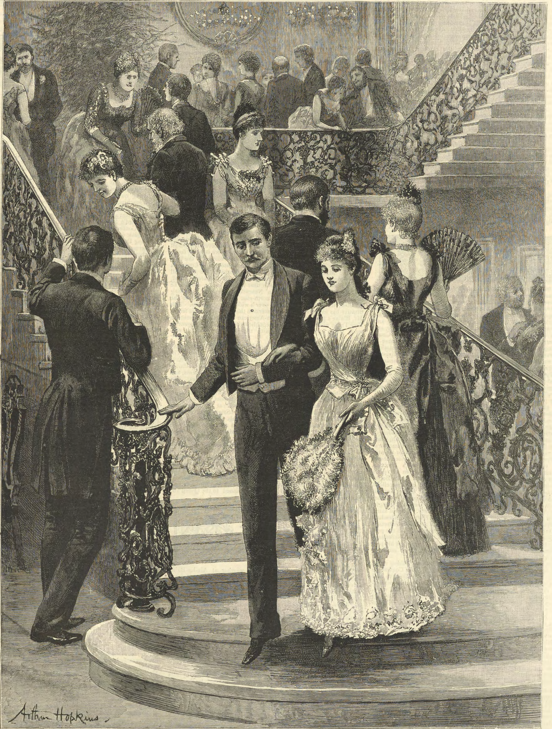
GOING DOWN TO SUPPER "MY FIRST BALL"