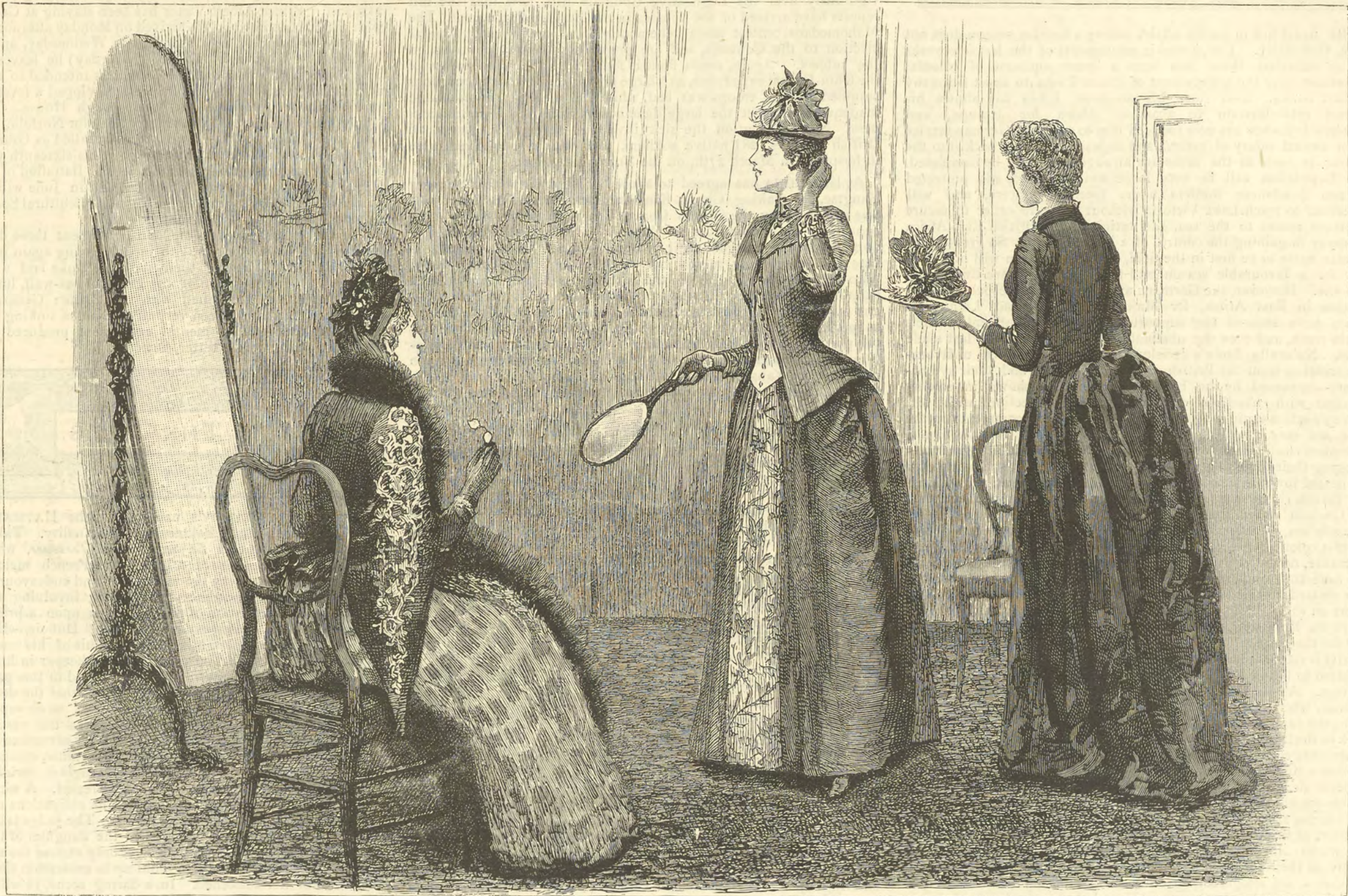
AT THE MILLINER'S "Just then Madame Araminte came in with some fascinating hats"

"I do not think it will be advisable for Gwendolyn to form herself on Mrs. Calthrop Wendry."