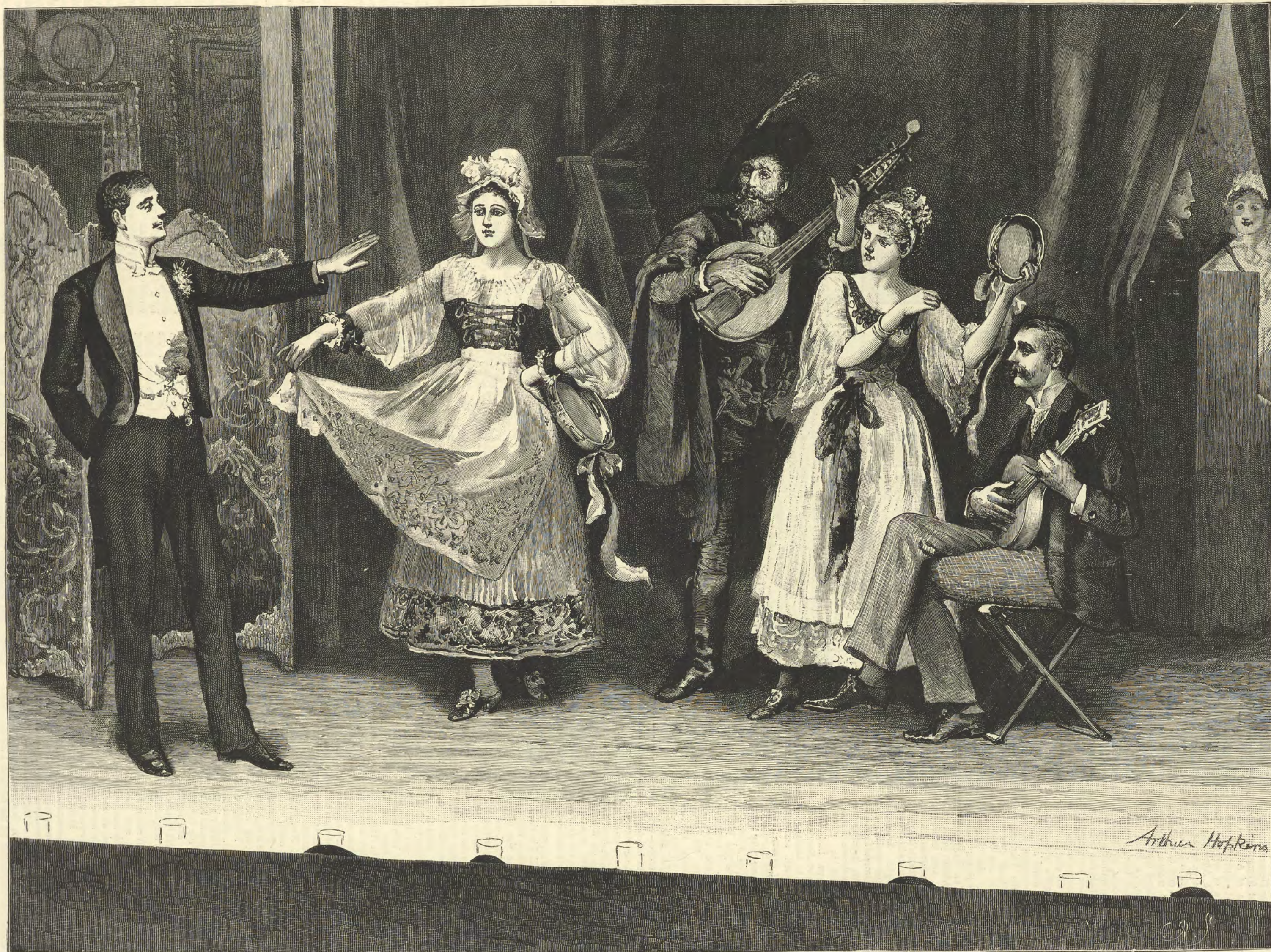
PRIVATE THEATRICALS—A DRESS REHEARSAL "MY FIRST SEASON"