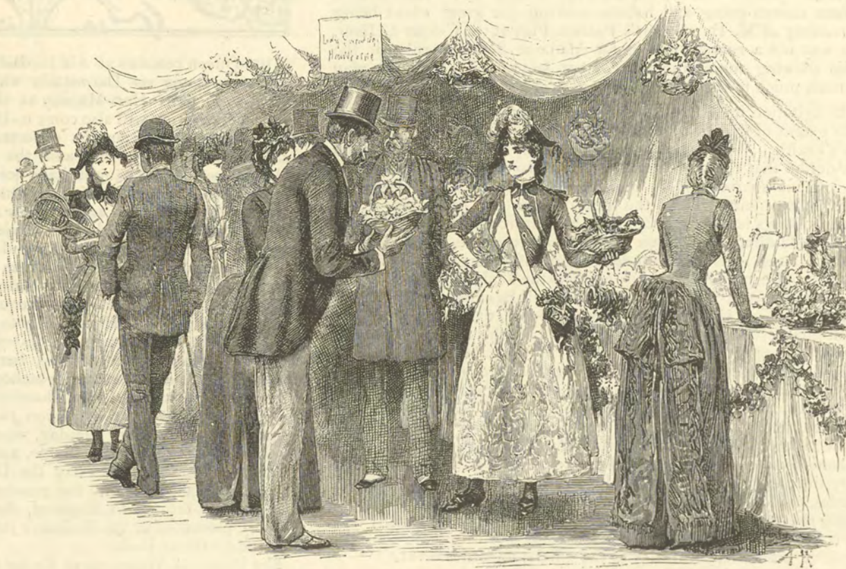
THE BAZAAR "I was selling baskets of flowers"