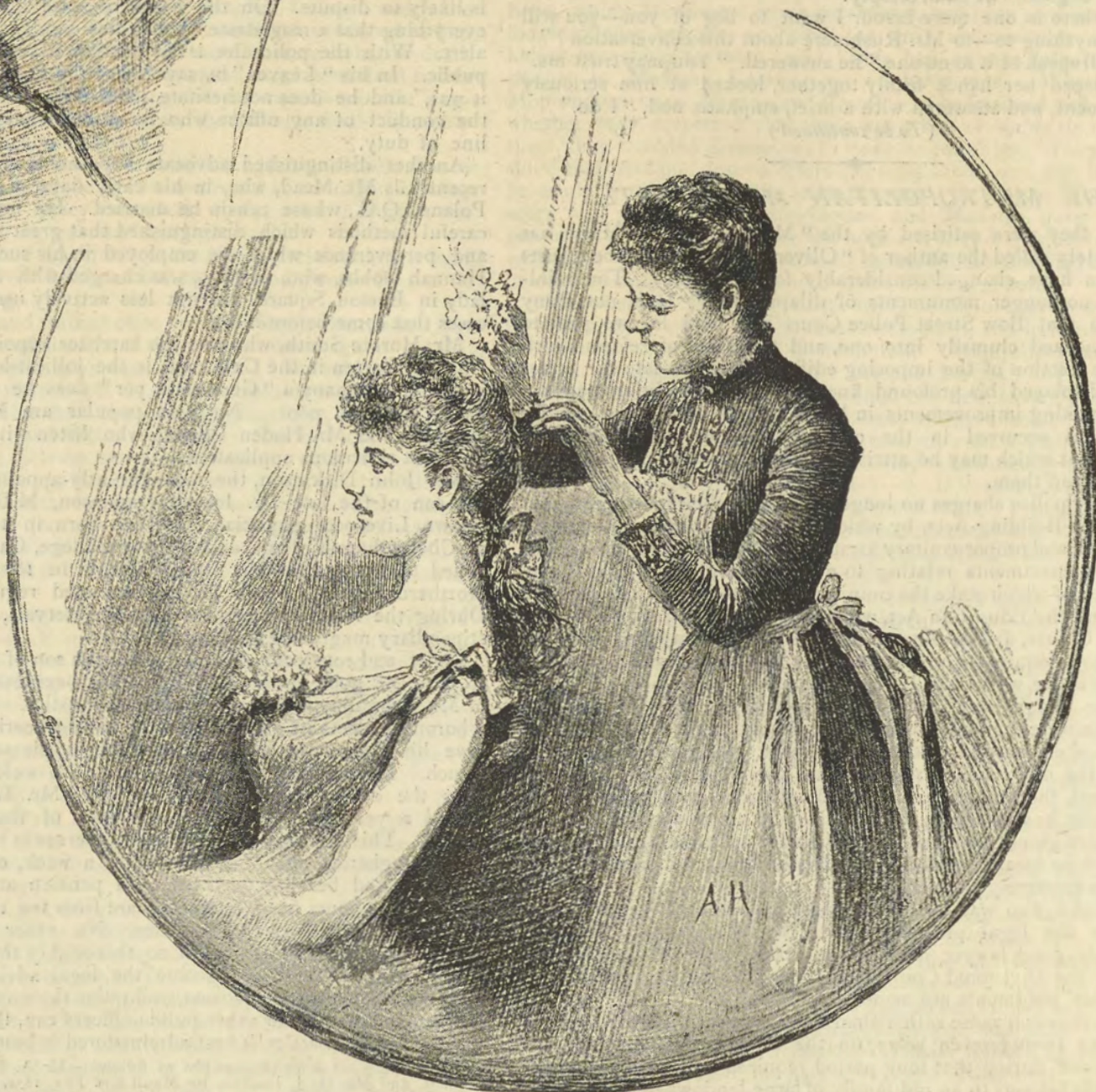
“CÉLESTINE DID MY HAIR DIVINELY”

I don't remember anything particular about any one else except a man I danced with nearly the last. He was less like the other